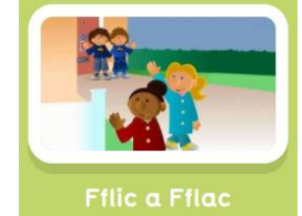
Fflic a Fflac